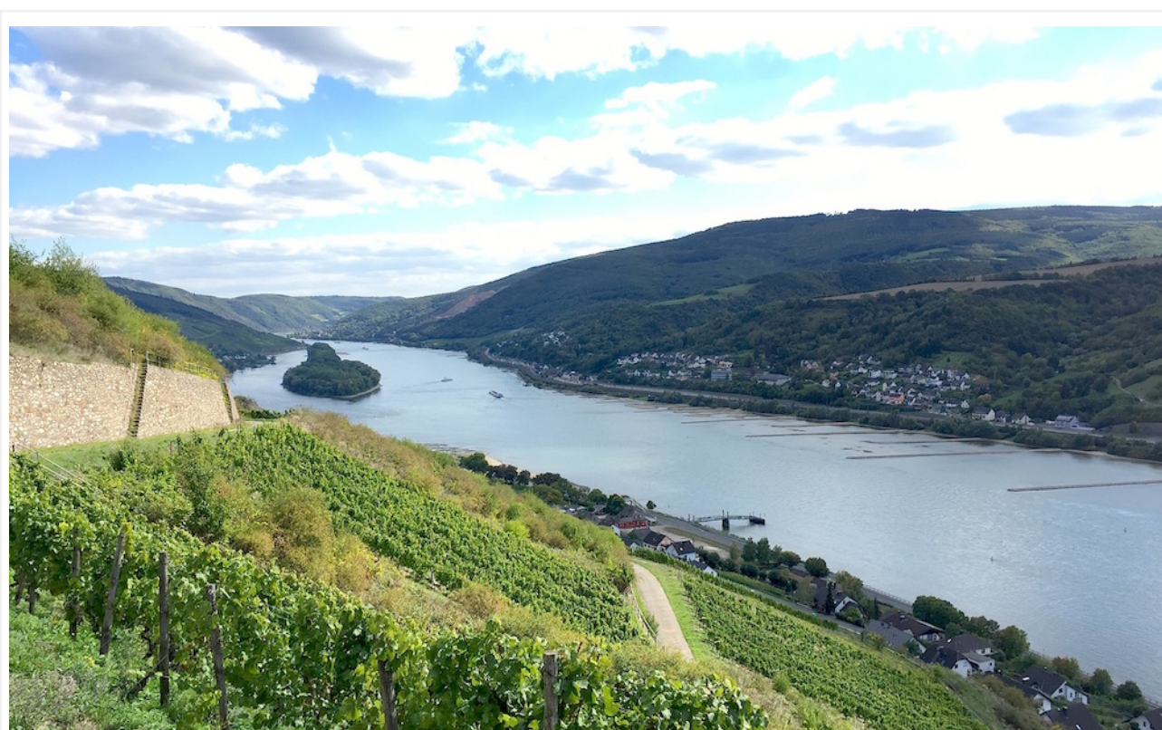
The steep vineyards of Lorch at the spectacular northern tip of the Rheingau.