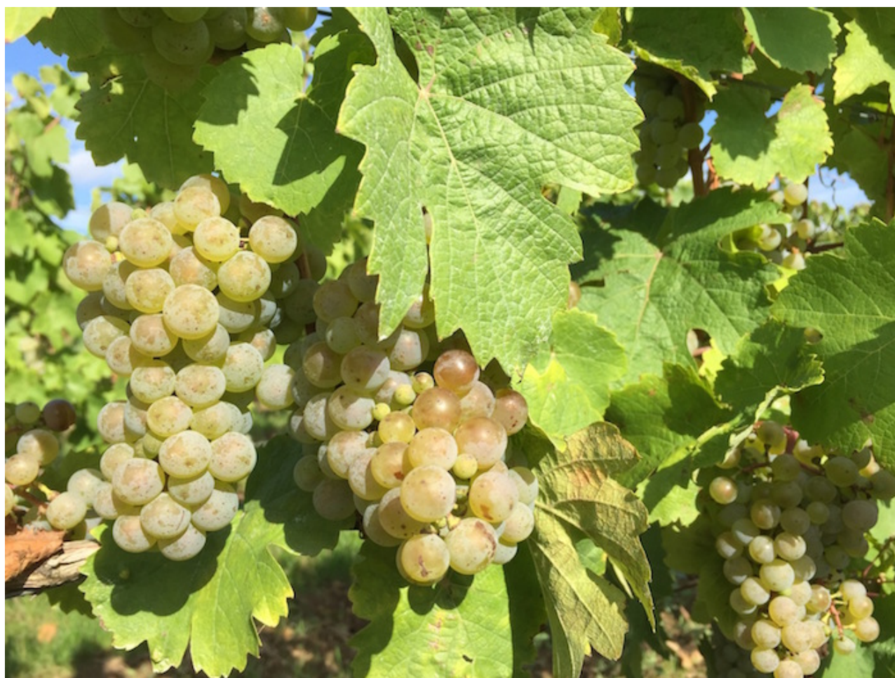
Riesling grapes of the ripe and clean (i.e. zero Botrytis) kind that are used to make the top dry Rheingau wines.

rated wine in this report—the 2015 Jungfer Auslese “Gold Cap” from the small Prinz estate in Hallgarten—scored a perfect 100 and is nobly sweet. All nine of the nobly sweet 2016 Rieslings from the large Robert Weil estate in Kiedrich scored 95 plus, wines that combine staggering concentration with breathtaking finesse. A great many dry Rheingau Rieslings (look for “trocken” or “GG” on the label) also rated 90 plus with a handful scoring as high as the top sweet wines.